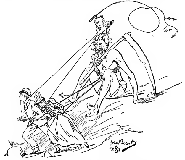
"TIME DRAGGED HEAVILY FOR BOTH, NOW."

And so her afternoon was one long fret. Broken at intervals. Three times she had to go down stairs on errands—that is, she thought she had to go down stairs on errands. Thus, going and coming, she had six glimpses of him, in the aggregate, without seeming to look in his direction; and she tried to endure these electric ecstasies without showing any sign, but